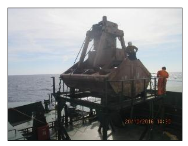
Figure 2: Crew members renewing the wire rope

Several crew members, i.e. , the bosun, three able seamen (ABs), and two ordinary seamen (OS) made their way to the deck to work on the wire rope renewal (Figure 2). All were appropriately attired – working gloves, safety shoes, safety helmets, and fall arresters. The chief mate was in charge of the task.