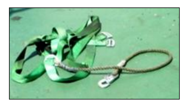
Figure 4: The fall arrester in use at the time of the accident

After the completion of the work, disengaging this particular type of fall arrester (Figure 4) from its anchor point was essential for the individual crew member to climb down from the grab.